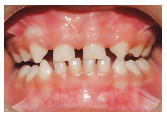
Fig. 1: Intraoral photograph showing missing maxillary primary right and left lateral incisors

A 3-year-old male patient reported with parents complaining of decayed teeth. The patient was healthy with no evidence of any syndromic features. On intraoral examination, we noticed missing of primary lower right central incisor (Fig. 4). Radiographic examination revealed the same finding, thereby confirming the congenital agenesis of primary tooth (Fig. 5).