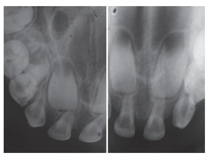
Fig. 3: Periapical radiographs confirming the agenesis of primary lateral incisors