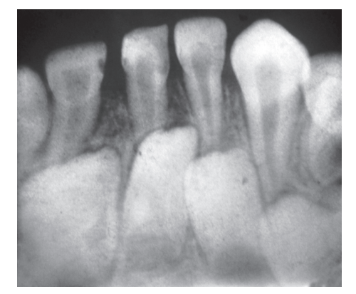
Fig. 5: Intraoral periapical radiograph showing congenital agenesis of mandibular right lateral incisor

Hypodontia and oligodontia may be inherited as an autosomal dominant trait with incomplete penetrance and variable expression. Mutation of genes, such as Msh homeobox 1 (MSX1) and paired box protein 9 (PAX9) have been shown in families with nonsyndromic familial oligodontia.<sup>10</sup> Certain studies suggest that the two members of the tooth family (primary teeth and its permanent successor) function rather as separate modules by the