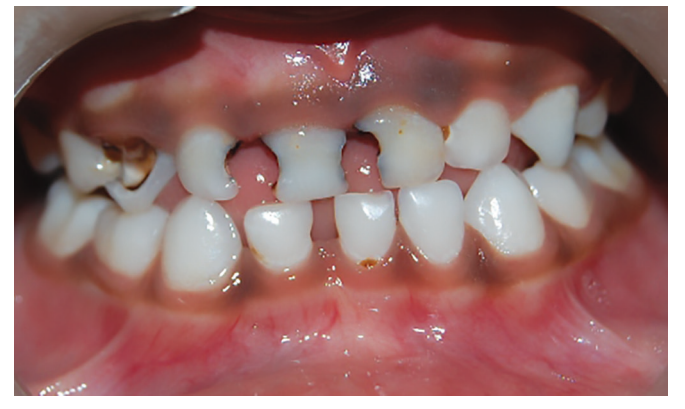
Fig. 4: Missing primary mandibular right lateral incisor