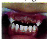
Fig 1: PRE-OP PICTURE INTRA ORAL.