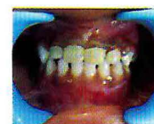
Fig 5: POST OP PICTURE OF FINAL RESTORED ANTERIOR