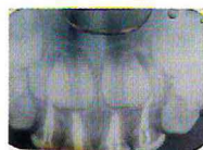
FIG 3: POST OP INTRAORAL PERIAPICAL RADIOGRAPH.