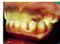
Fig 4: OMEGA EXTENSION PLACED INSIDE THE CANAL