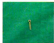
FIG 2: OMEGA EXTENSION