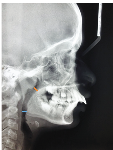
Fig. 1: Upper pharyngeal space marked in orange color. Lower pharyngeal space marked in blue color

Data comprising of linear upper and lower pharyngeal space measurements were evaluated with the pairwise comparison test and repeated one-way analysis of variance (ANOVA) was used for the comparison of airway dimension changes over time. Post hoc test (Bonferroni test) was used for multiple comparisons of dimensions between different time intervals. A probability ( p value) of <0.05 was considered statistically significant. All data were evaluated using statistical software (IBM SPSS V23.0, IBM Corp., Armonk, NY, USA).