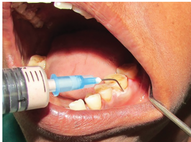
Fig. 1: Local delivery of Curenext ® gel using disposable syringe

The clinical parameters recorded were: PI, 15 GI, 15 GBI, 16 PPD, 17 and CAL. 17 The PPD and CAL were measured for the selected teeth using University of North Carolina 15 probe. The treatment modalities were divided according to the split-mouth protocol. 18 The upper arch was the control group where SRP was performed and the lower arch was experimental group, which received SRP + CU. The clinical parameters were recorded at baseline, and