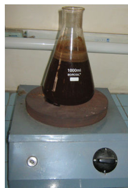
Fig. 1. Aqueous extract of Terminalia Chebula

In group A, The subjects were made to rinse orally, a 10% concentrated extract of the Terminalia Chebula and made to retain it in the mouth for 40 seconds before expectorating it. They were not allowed to rinse with water or to consume anything orally for 90 min following the test. The pH and buffer test were repeated at 30 and 60 minute intervals.